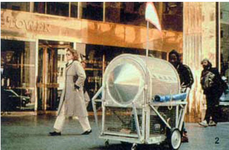
Figure 2: Krzysztof Wodiczko (1988) Homeless vehicle.

In the field of film it has been obvious to consider Road movies, notably the cinema of Wim Wenders, David Lynch and Jim Jarmusch.