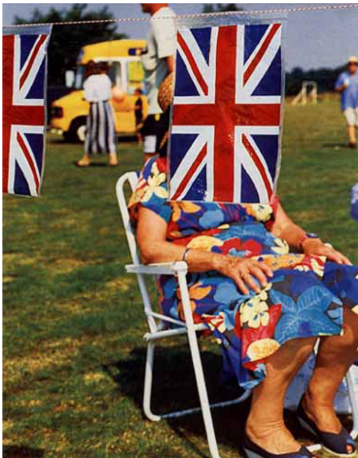
Figure 1: Martin Parr (2006) Photographing Britain.