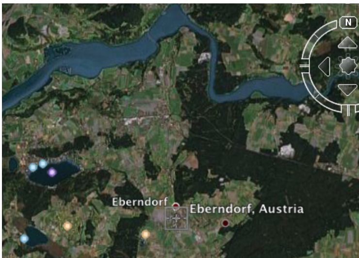
Figure 8: Screenshot (2007) Google Earth.

Un-mapping, remapping and counter-cartographies can be found within contemporary art practices referring to different perceptions of geography. (Rogoff, 2000) In my project about “mapping home” I tried to join this practice, drawing a map of my homesickness. The graphical outcome is a rather subjective and emotional interpretation of land and distance, but nevertheless a signifying representation of both location and identity.