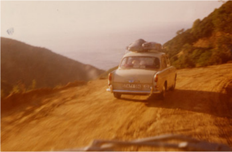
Figure 3: Projekt Migration (2002-2006).