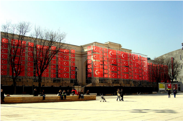
Figure 4: Feridum Zaimoglu (2005) Kanak Attack.